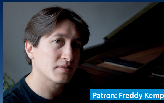
Patron: Freddy Kempf

International concert pianist, recording artist and broadcaster. BBC Young Musician of the Year 1992; Bronze Medallist, Tchaikovsky Piano Competition, Moscow 1998; Classical Brit Award 2001. Recent recitals include the Sydney Opera House, Berlin Konzerthaus, Moscow Conservatoire's Great Hall & Tokyo's Suntory Hall. His recent CD of Rachmaninov, Bach, Ravel and Stravinsky was praised by BBC Music Magazine for its "wonderful delicate playing and fine sense of style". His recent orchestral disc, Prokofiev's Piano Concertos Nos. 2 & 3 with the Bergen Philharmonic Orchestra was nominated for the prestigious Gramophone Concerto award. His most recent CDs featuring Schumann and Tchaikovsky have received critical acclaim.